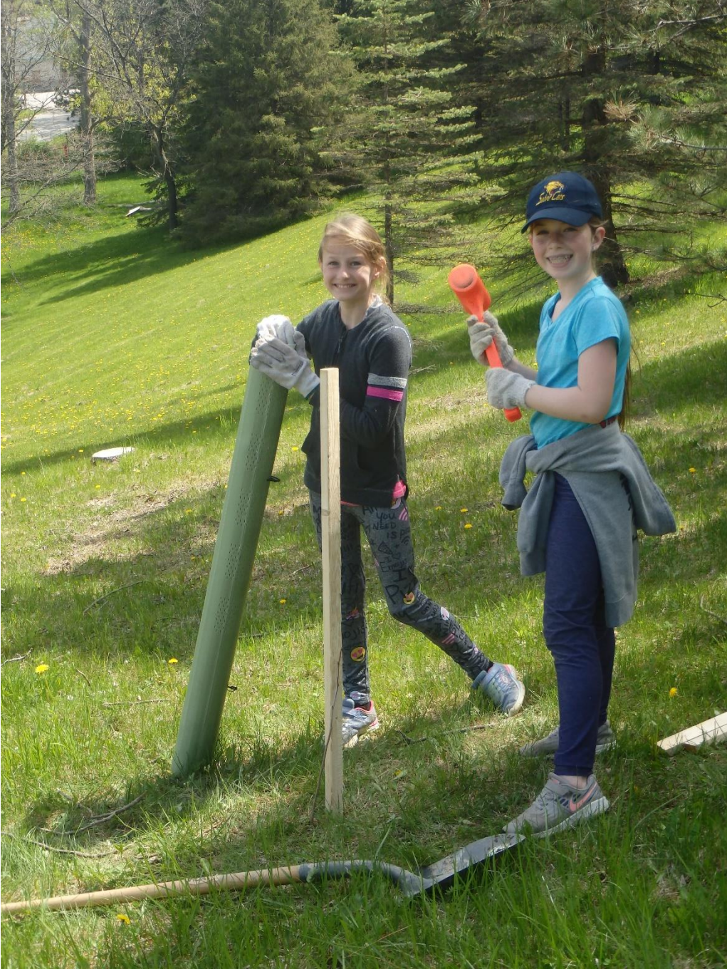
Two students from St. Catherine of Siena Catholic School volunteering at a tree planting project