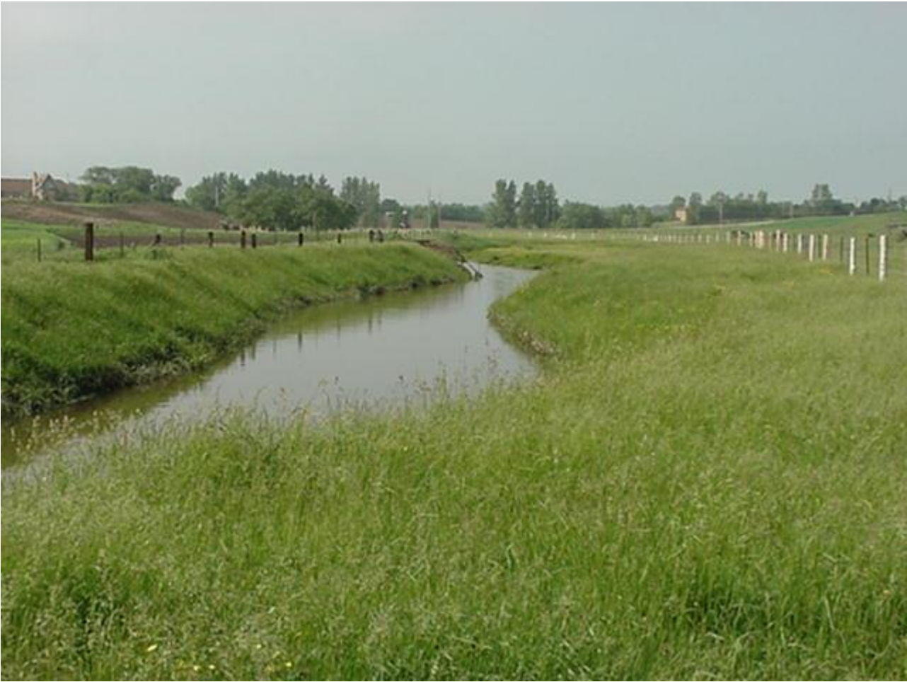
Buffer fencing that filters runoff